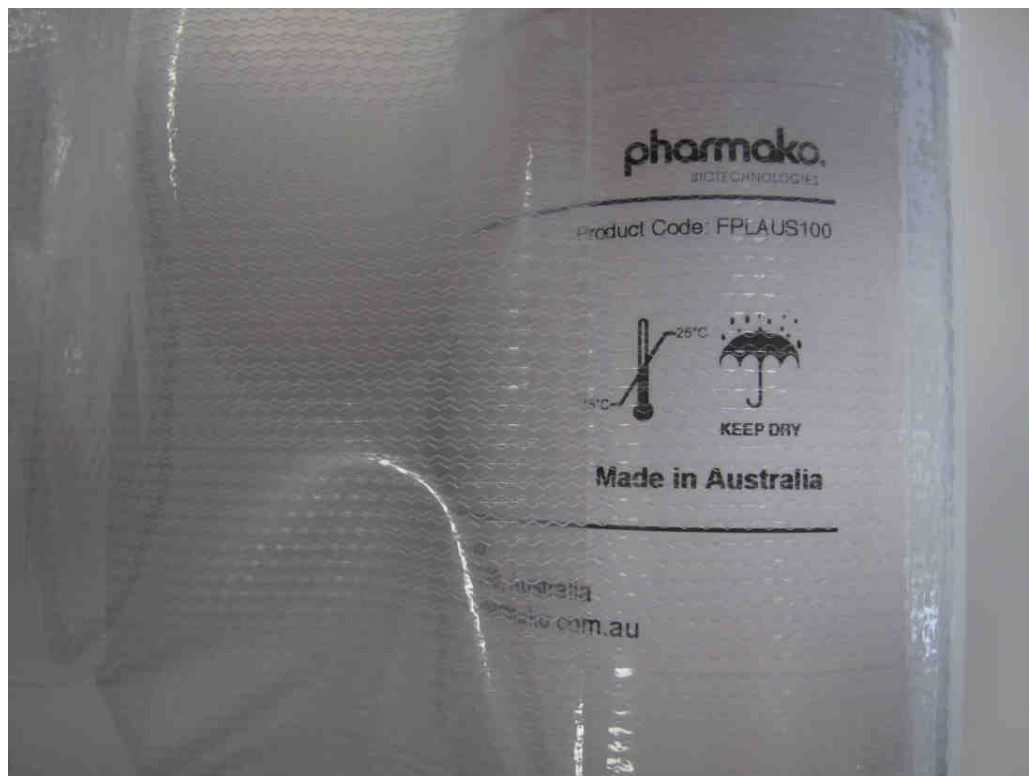
Foto der Probe / Sample photo